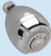
Low Flow Showerhead