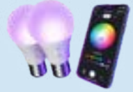
Smart LED Bulb