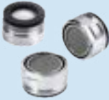
Bathroom Sink Aerator